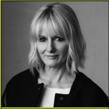
Jane Shepherdson CBE | Director